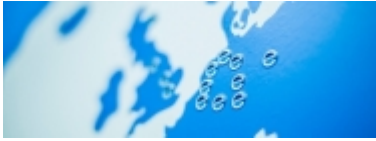
Element Materials Technology

Medical Device Testing Services An Element Materials Technology Company