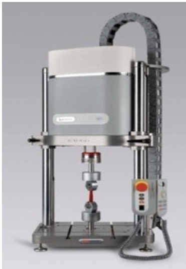
Instron ElectroPuls E3000