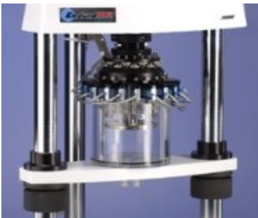
Bose ElectroForce 3200