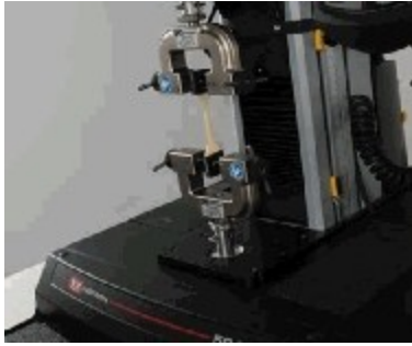
Instron 5944 Tension/Compression

Since 1990, MDT has been providing quality test services to meet FDA requirements at competitive prices. Please contact us if you are interested in taking a tour of our facility or would like to discuss your test requirements with our staff.