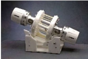
Bose 9120 SGT