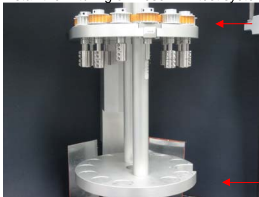
Top Platen: Torsional Displacement